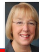
Patty Murray (D)