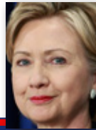
Hillary Clinton (D)