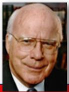
Patrick Leahy (D)