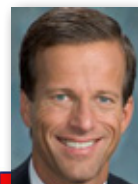
John Thune (R)