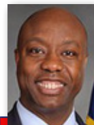
Tim Scott (R)

The Christian Coalition is a pro-family, citizen action organization. This voter guide is provided for educational purposes only and is not to be construed as an endorsement of any candidate or party.