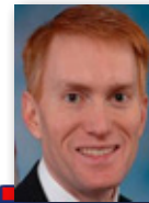
James Lankford (R)