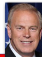
Ted Strickland (D)