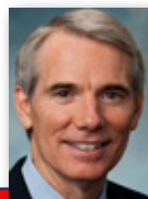
Rob Portman (R)