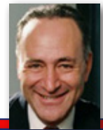
Chuck Schumer (D)