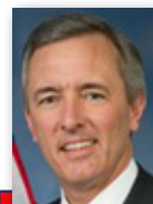
John Katko (R)