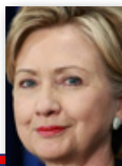
Hillary Clinton (D)