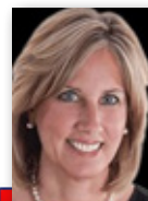
Claudia Tenney (R)