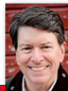
John Faso (R)