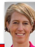
Zephyr Teachout (D)