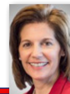
Catherine Masto (D)