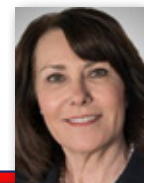
Jacky Rosen (D)