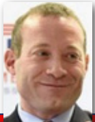
Josh Gottheimer (D)