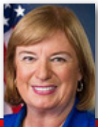
Carol Shea-Porter (D)