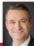
Don Bacon (R)