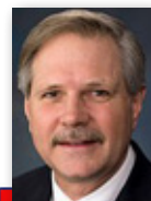
John Hoeven (R)