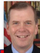
Tim Walberg (R)