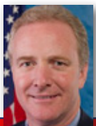
Chris Van Hollen (D)