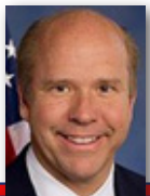
John Delaney (D)