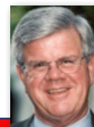
Foster Campbell (D)