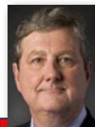
John Neely Kennedy (R)