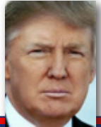
Donald Trump (R)