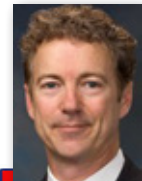
Rand Paul (R)