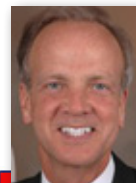
Jerry Moran (R)