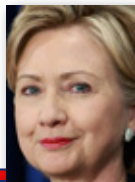
Hillary Clinton (D)