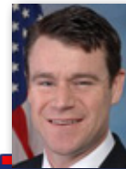
Todd Young (R)