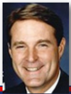
Evan Bayh (D)