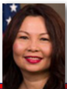
Tammy Duckworth (D)