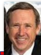
Mark Kirk (R)