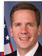
Robert Dold (R)