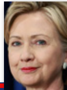
Hillary Clinton (D)