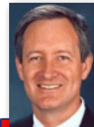
Mike Crapo (R)