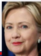
Hillary Clinton (D)