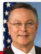
Rod Blum (R)