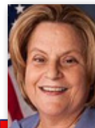
Ileana Ros-Lehtinen (R)