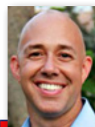
Brian Mast (R)