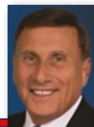
John Mica (R)