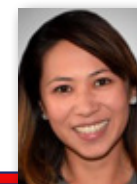
Stephanie Murphy (D)