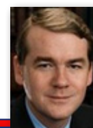
Michael Bennet (D)