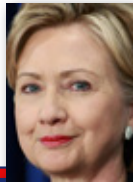
Hillary Clinton (D)