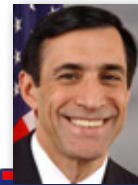
Darrell Issa (R)