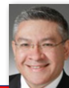
Salud Carbajal (D)