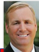
Jeff Denham (R)