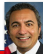
Ami Bera (D)