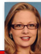
Kyrsten Sinema (D)