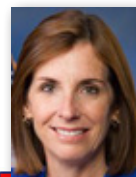
Martha McSally (R)