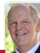
Tom O'Halleran (D)