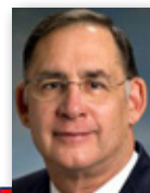
John Boozman (R)