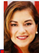
Loretta Sanchez (D)