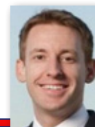
Jason Kander (D)