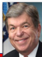
Roy Blunt (R)